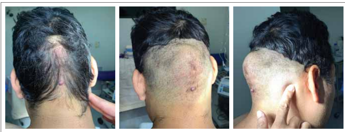
Fig. 1. Photographs prior to surgery.